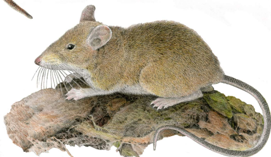
Apomys "Megapomys" sp.