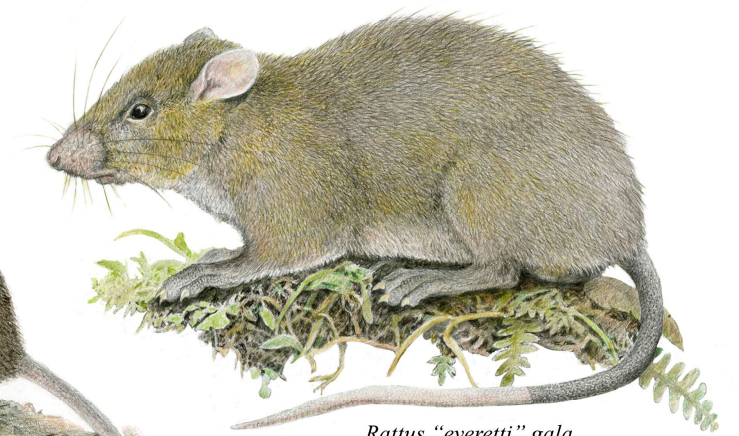
Rattus "everetti" gala